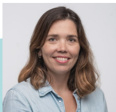
Head of International Office igr.international@univ-rennes.fr